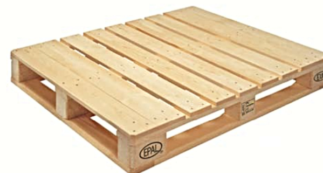
EUR2 Pallet (1200x1000 mm)