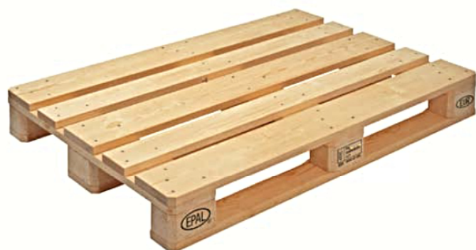
EUR Pallet (800x1200 mm)

The specific EUR pallet types are characterized by various dimensions and construction, but they all comply with rigorous norms and are manufactured accordingly to UIC 435 Code.