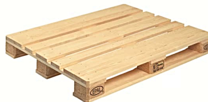
EUR3 Pallet (1000x1200 mm)

The blocks in EUR pallets can be made of either solid or crumbled wood.