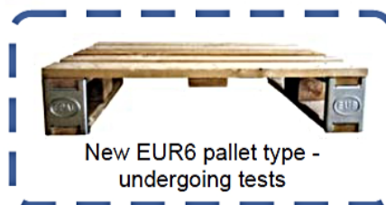
New EUR6 pallet type - undergoing tests