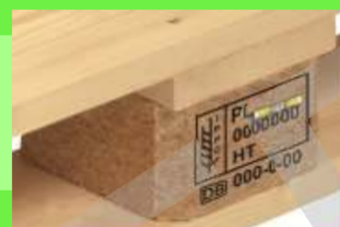
EUR EPAL Pallet