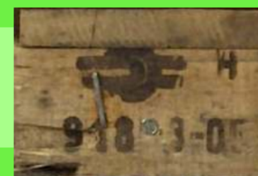
EUR Pallet MAV (Hungary)