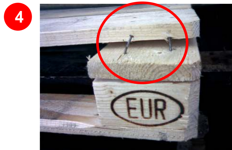
4 Chipped board, exposing 2 or more nails.