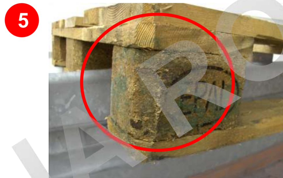
5 No rotten wood or fungus is allowed at all. Such pallets shall be recycled.