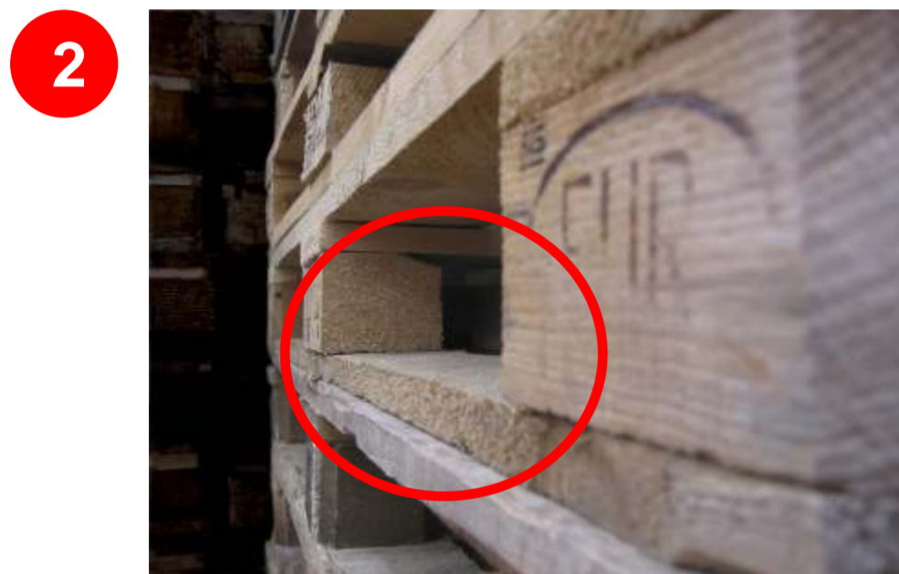
2 No millings on the upper edges of the bottomdeck boards.