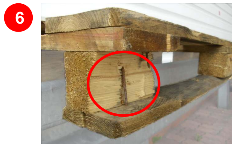
6 Chipped block, exposing any nails.

Pallets with unacceptable flaws shall be repaired (if possible) or recycled.