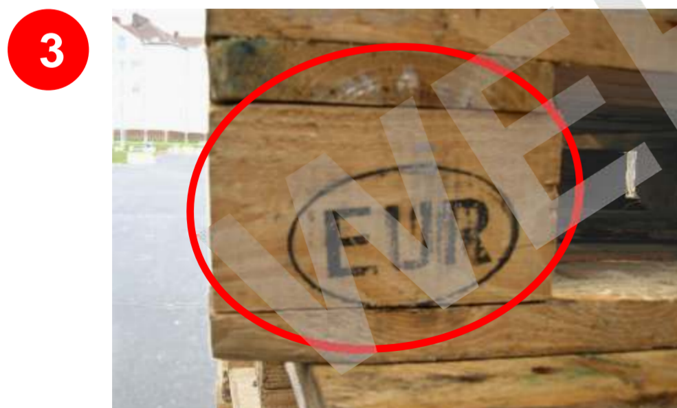
3 Incorrect marking on the blocks.