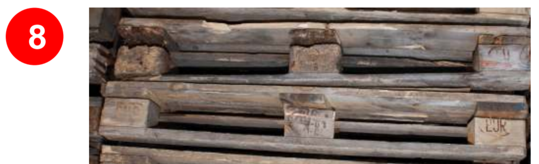
8 Poor general condition of the pallet, eg: - major contamination, e.g. lubricants, grease, cement; - use of impermissible elements (boards, bearers, nails); - improper positioning of the elements, e.g. bearer moved versus boards.