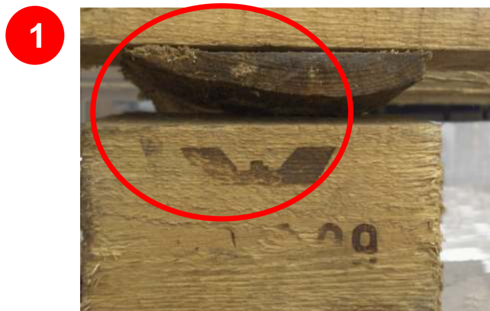
1 Wanes (chippings) are not allowed on the stringer boards (middle, side).